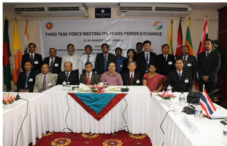
Participants from BIMSTEC Members States at 3rd Task Force Meeting on Trans Power Exchange, Dhaka, 23-24 August 2011