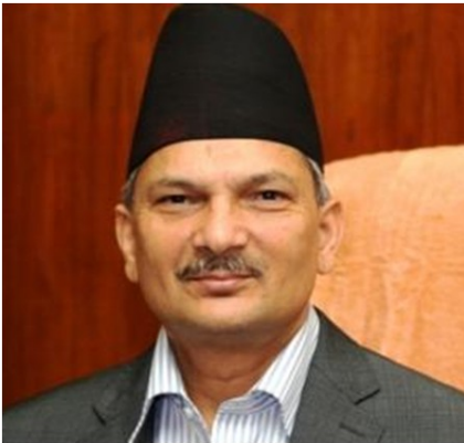
Dr. Baburam Bhattarai, Prime Minister of Nepal

Dr. Baburam Bhattarai, member of Constituent Assembly and vice-chairman of the United Communist Party of Nepal (Maoist) has been elected as the Prime Minister of Nepal in the election held at the Constituent Assembly on 28 August 2011. Dr. Bhattarai, was elected the 35th Prime Minister of Nepal with support from the United Democratic Madheshi Front