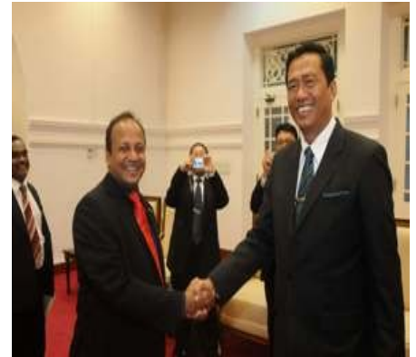
Mr. Neomal Perera, Deputy Minister for External Affairs of Sri Lanka greets Mr. U Maung Myint, Deputy Minister for Foreign Affairs of the Republic of the Union of Myanmar

for External Affairs of Sri Lanka. The Deputy Minister of Myanmar also held discussions with Mr. Neomal Perera to further enhance and consolidate relations between the two countries. Both the Ministers discussed a wide range of bilateral issues and also exchanged views on further cooperation on international issues.