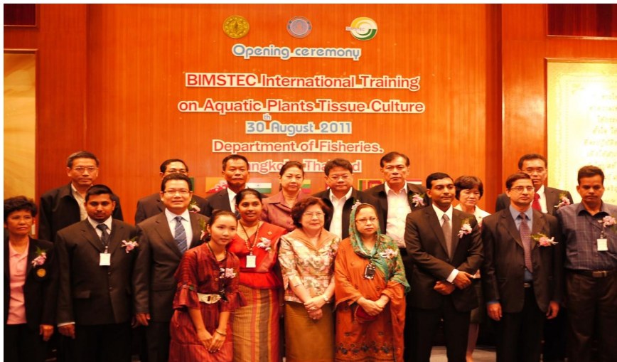
Participating delegates from Member States at BIMSTEC International Training on Aquatic Plants Tissue Culture, Bangkok, 30 August 2011

The Department of Fisheries of Thailand, in cooperation with the Thailand International Development Cooperation Agency, Ministry of Foreign Affairs of Thailand, organized the BIMSTEC International Training on Aquatic Plants Tissue Culture at the Aquatic Plants and Ornamental Fish Research Institute, Inland Fisheries Research and Development Bureau, Dept. of Fisheries from 29 th August to 27 th September 2011. Seven trainees from six BIMSTEC Member Countries participated in this training programme.