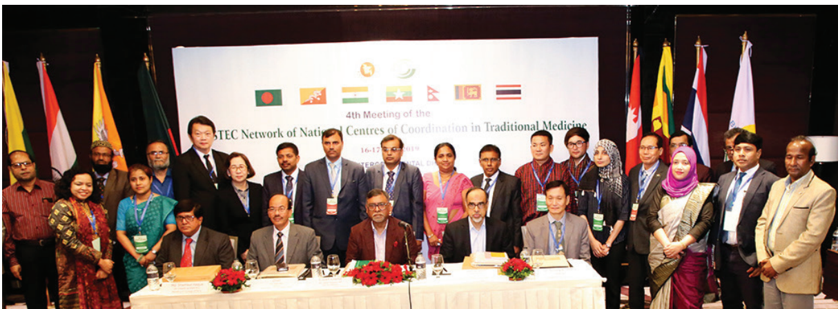
H.E. Mr. Zahid Maleque, M.P, Minister of Health and Family Welfare, Government of Bangladesh (centre)

The Fourth Meeting of the BIMSTEC Network of National Centres on Coordination in Traditional Medicine (BNNCCTM) was held on 16-17 June 2019 in Dhaka, Bangladesh at the invitation of the Government of the People's Republic of Bangladesh. Delegations from all BIMSTEC Member States attended the Meeting.